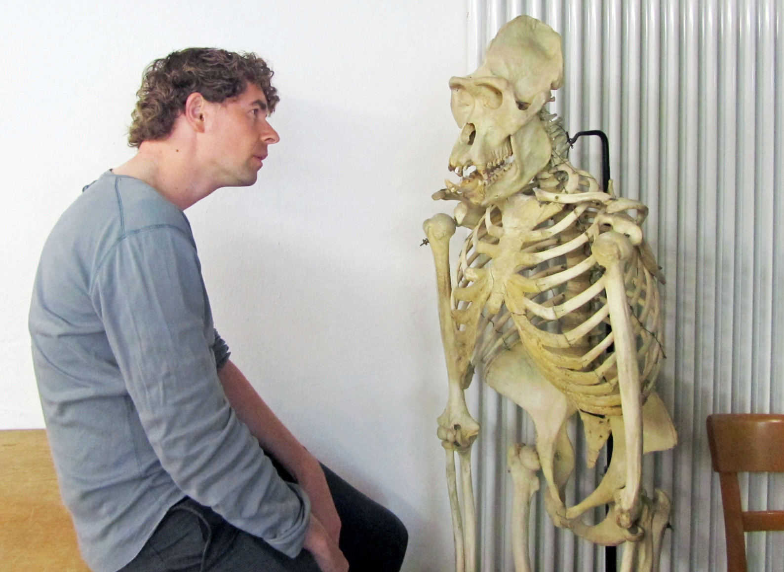
Chatting with a close relative: This ape skeleton displayed in the basement of Tübingen University has already been eyed by many generations of students, while the human skulls dating back to the Middle Ages are stored in cardboard boxes, inventoried according to site of the find.

he doesn't regret having grown up in a socialist state. "My political views are rather left-wing and liberal. Had I grown up in the West, I'm sure my left-wing views would be much more extreme. What I learned is that real socialism and the human factor simply aren't compatible."